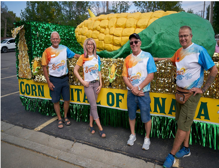
Members of Coaldale Town Council in Taber to show their support for Taber Corn Fest (August 24, 2023)