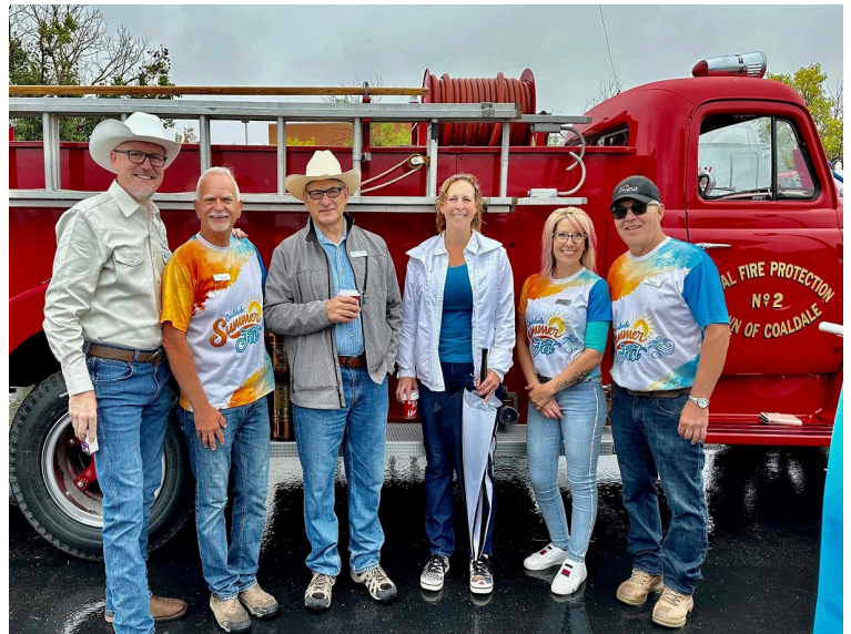
Members of Coaldale Town Council in Lethbridge to show their support for Whoopup Days (August 22, 2023)