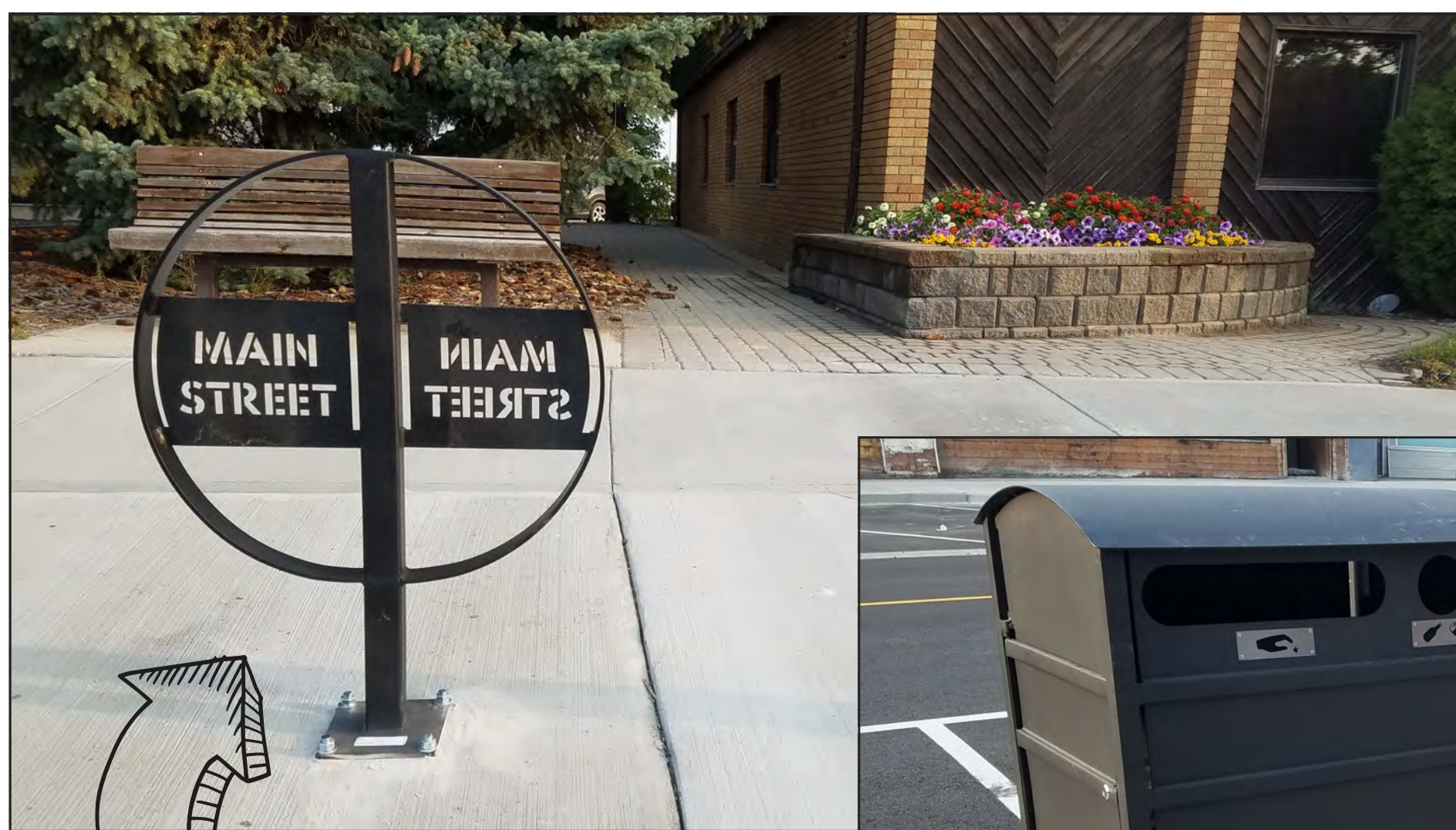
Main Street bike rack!

The Main Street project has reached an exciting milestone as our new street furniture is starting to be installed. These additions will enhance Main Street's unique character and give residents new ways to experience the heart of our community. Come down to Main Street to check out the street furniture that was selected based on community feedback from earlier this year.