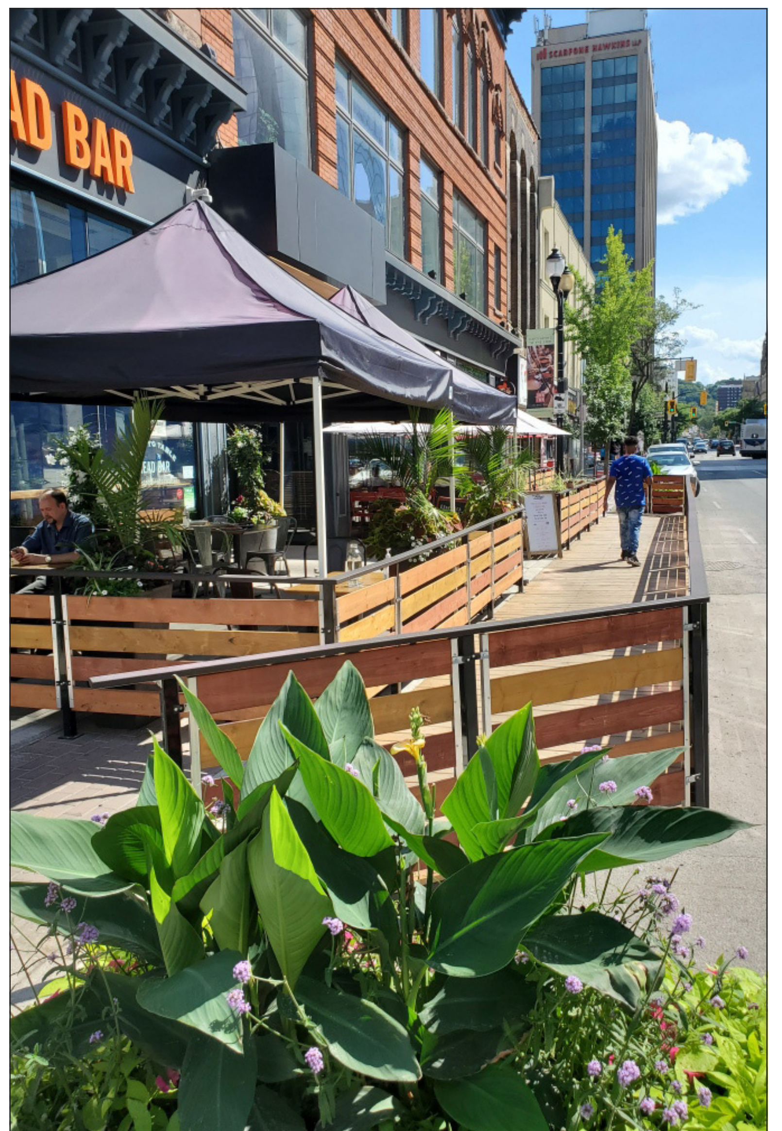
Example of an outdoor patio in front Bread Bar, a restaurant in Hamilton, Ontario, with a close up of the outside sidewalk extension around the patio.

"The Town is committed to continually engaging with stakeholders throughout the pilot of this project to inform the decision on a future temporary seasonal patio policy," said Croil. "We are striving to maintain consistent dialogue with the community as we continue to introduce innovative initiatives that encourage investment in Coaldale, particularly in our downtown core. Our goal is to continue thinking outside of the box on strategies that will ultimately grow our local businesses community."